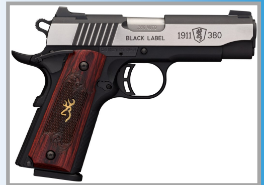
BROWNING 1911 .380 Medallion Pro MSRP $899.99 (1 Winner)