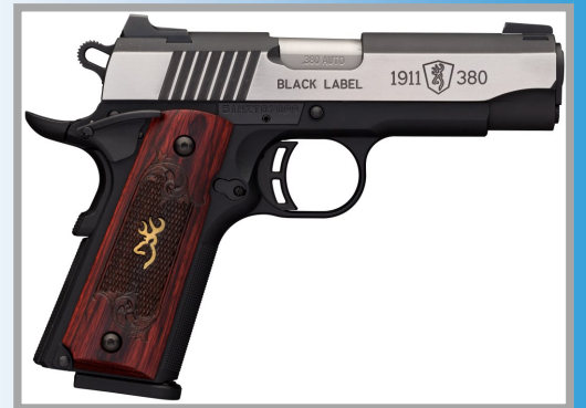
BROWNING 1911 .380 Medallion Pro MSRP $899.99 (1 Winner)