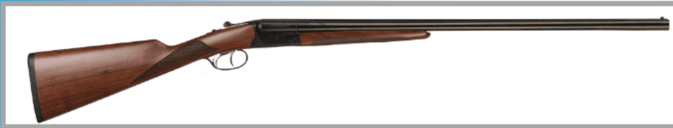
CZ-USA Bobwhite G2 20 Gauge Side by Side Shotgun MSRP $799.00 (1 Winner)