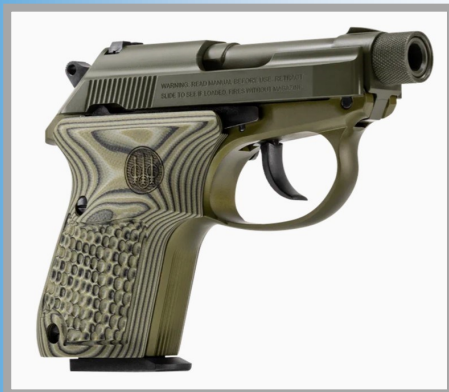
Beretta 3032 Tomcat .32 ACP MSRP $649.00 (1 Winner)