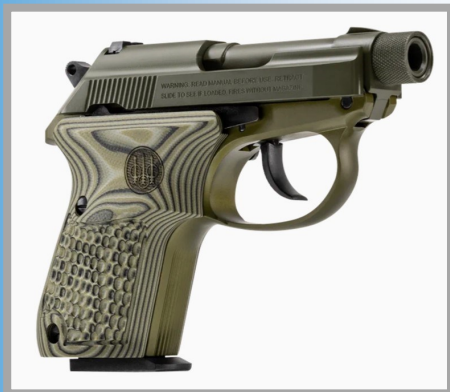
Beretta 3032 Tomcat .32 ACP MSRP $649.00 (1 Winner)