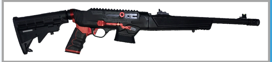
RUGER PC Carbine accessorized by TANDEMKROSS MSRP $1100.00 (1 Winner)